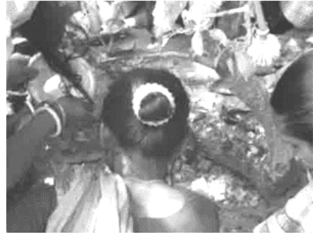
tjv vPj vKvj MtQi wKotK cRv Kiv nt`Q

hvq, Zv ntjv GwU cieZPga`hM wbgZ 17 cUPxb `vcZ`i AmacZ`kxj eqvbi tKv_vl G_s,tjvi mvf_ `vbxq bvixi m`uK`LuRvi tPov Kiv nq w| wKs` bvi`i eZGvb RgvqZ Ges Zv`i `Z`K cR Kti ejv hvq, GB aitbi `vcZ` bvi`i `i`ZcY`RgvqZi RvqMv wQj, hvi ZvrchEY` Av_`mvgwRK, ivR`wZK `i`Zi h_vh_ wekH`Yi `we ivfL| Gfvte wekH`Y Ki tj `vcZ`i Mtq th cj`l BtgR AuKv ntqQ, Zvi weciZ Gi m½ bixi RgvqZ I wj BZvi GK wfbEwZnm `Zwi Kiv thZ cvti, hv `vcZ`i BwZnmK Avtiv teuk mvgwRK I ivR`wZK Kti Zj tZ mrvh` Ki te|